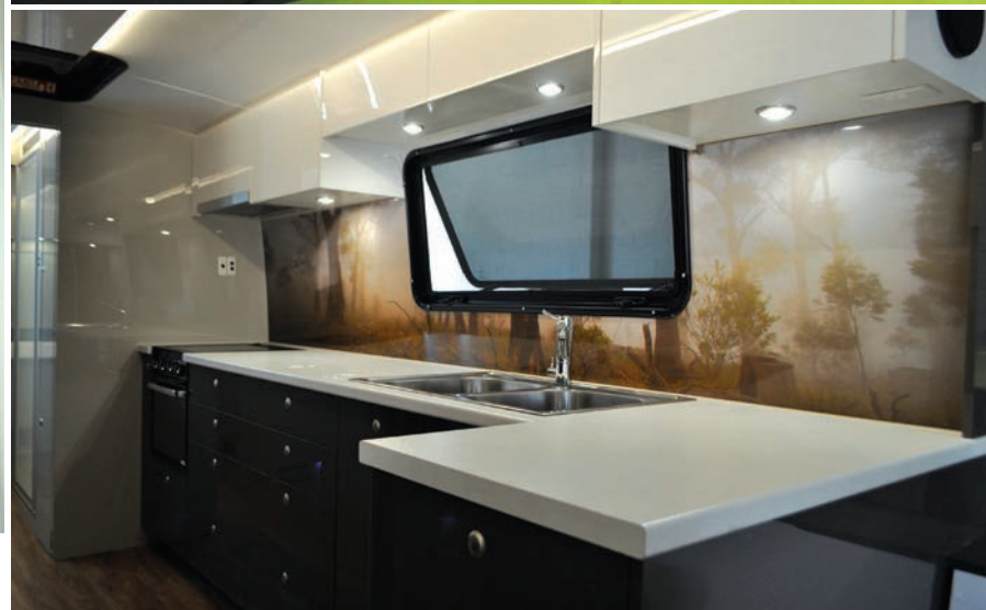
Clockwise from top left: The Sun Power crew returning to the factory floor; the Man Bus; inside the Man Bus; That’s a lot of solar power