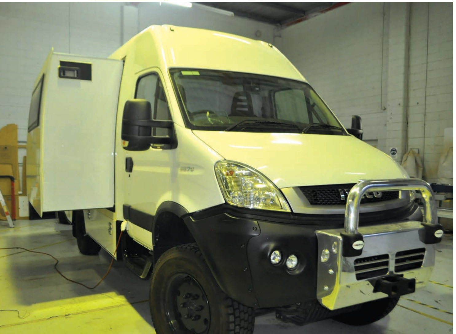
From top: A coaster's kitchen area; An Iveco mid-transformation