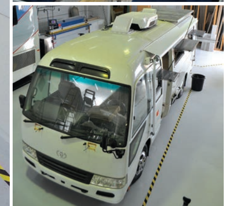
Clockwise from top right: Building battery setups to suit individual needs; the Matilda classroom; Inside another Man Bus; A coaster in the making; The Sun Power factory floor